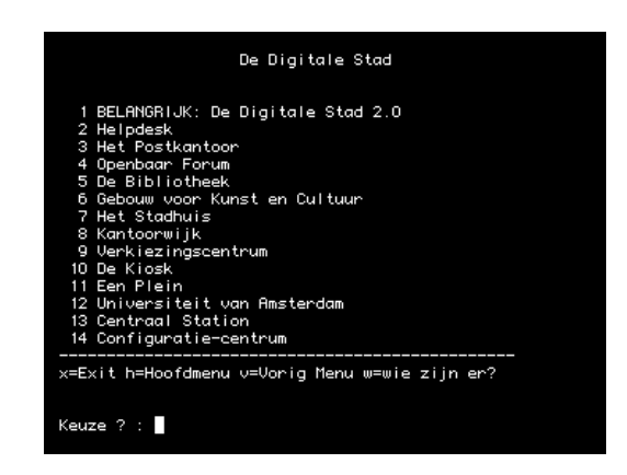
Figure 4.2: Main page of DDS 1.0 was based on the Gopher protocol

this code. Inside the script file, the definition for the creation for a new user was located. It showed that several folders were created per user, like the ones described below. There was also one line of code that declared a variable, which turned out to be our next lead. This variable called DODOPROG, contained a path to another program.