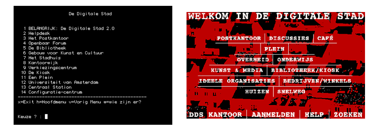
Figure 2.1: Screenshots of DDS 1.0 and 2.0

different reason to step back from the original Freeport software is that people did not like Freeport: it was too slow. Version 3.0, from 1995, introduced squares and residential areas, in which people could build their own homes (web pages).