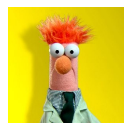
Figure 6.2: Beaker from The Muppet Show