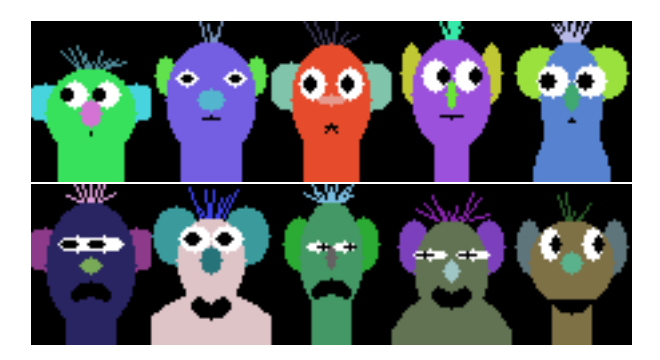
Figure 6.1: Old and New Avatars

written too lazily to actually be able to compile and run this code. Erwin wrote at least two version of the dodo.c code, since there is a file called dodo.c.old. The new version was created on June 6^{\text{th}} 1995.